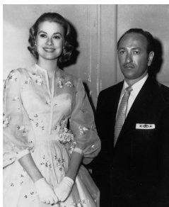
Michel with Grace Kelly

Michel Thomas (1914–2005) spent most of his childhood in Germany and France. He studied psychology at the Sorbonne (Paris) and at the University of Vienna. During the Second World War he fought for the French Resistance; after the war he worked for the U.S. army. His war-time experiences, including two years in concentration and labour camps and torture at the hands of the Gestapo, fuelled his passion for teaching languages, as a result of which he developed a uniquely effective language-